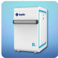
Genie PURIST Ultrapure Lab Water Systems

produces ultrapure water and EDI water from tap water directly.