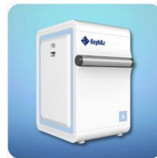
Genie A Ultrapure & RO Lab Water Systems

produces ultrapure water from RO, distilled or deionized water