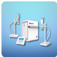
Genie G Ultrapure & EDI Lab Water Systems

produces ultrapure water and EDI water from tap water directly.